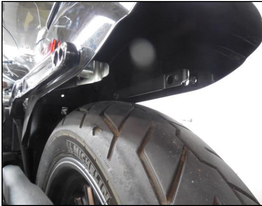
Rear Fender Mounting Bracket