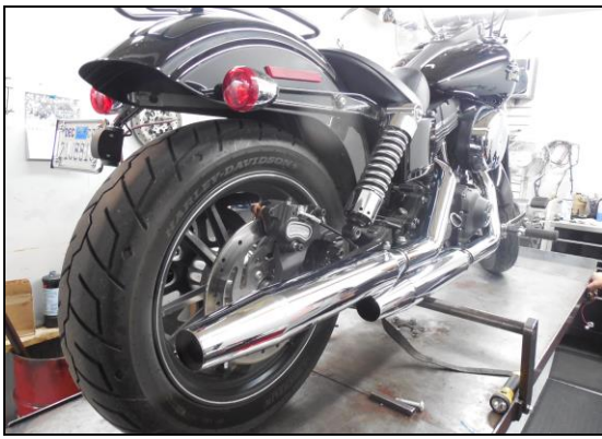
Motorcycle on Jack with Shocks Disconnected