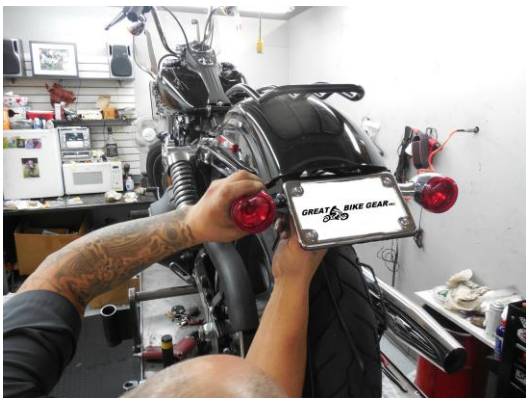
Turn Signals Installed