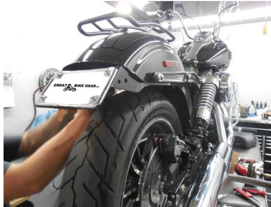
Mounting Bracket Installed