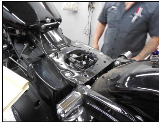
Access to wire connections